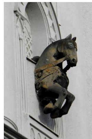
House sign of the Palace at the Black Horse

However, not only famous architectural monuments have their legends, there are many connected also with some minor sights, such as the one of the so called Palace at the Black Horse. In the past the houses did not have their street numbers, they had house signs instead, and the sign of this palace, standing in the Lower Square ( Dolní náměstí ) inspired the following humourous folk legend: A rich family used to live in the palace and one of their female servants fell in love with the son of the lord. She visited a herbalist who gave her a recipe for a love potion that the young man was supposed to drink. So she cooked it, but after she put it out to let it cool, another servant turned it over by accident and the potion was spilled into a bucket of water, which was given to a horse. As a result, the horse fell into so strong love with the girl that it pursued her everywhere, even into the upper rooms of the palace. The desperate maid finally jumped out of the window and killed herself. The horse tried to jump after her, but got stuck in the window and has stayed there, turned into stone, until nowadays.