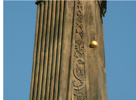
Replica of a stone shot in the shaft of the Holy Trinity Column

I also like a legend connected with the Holy Trinity Column. In 1758, shortly after the column was finished, Olomouc was besieged by the Prussian Army and the enemy artillery was heavily bombarding the city by cannon shots. The legend says that Olomouc citizens were much more afraid of damaging the column than of damages on their property and so they made a procession out of the city walls, and risking their lives they went to beg the Prussian general not to shoot at the column. Surprisingly, the general not only spared their lives, but also let them return back into the city and allegedly ordered the artillery not to aim at the sacred monument. The event is reminded by a gilded replica of a cannon ball set into the shaft below the top of the column.