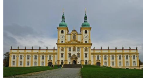
Church of the Visitation of Virgin Mary

One of the oldest Olomouc stone buildings are remnants of the so called Bishop's Palace, which is also considered to be one of the most important Romanesque buildings north of the Alps. Gothic is best represented by the St. Moritz Church. As for Baroque, there are plenty of important buildings built in this style, so I will pick up at least two. The Holy Trinity Column on the Upper Square ( Horní náměstí ) is absolutely the most important monument in Olomouc, whose significance is also underlined by the fact that it is the only historical sight in our region which was put on the UNESCO World Heritage Sites List. Another one is the Church of the Visitation of Virgin Mary on the east edge of the city on a hill called Svatý Kopeček (which can be translated into English as the Holy Hill). The church was promoted the so called Basilica Minor, mainly because of its rich history and its significance as a pilgrimage destination.