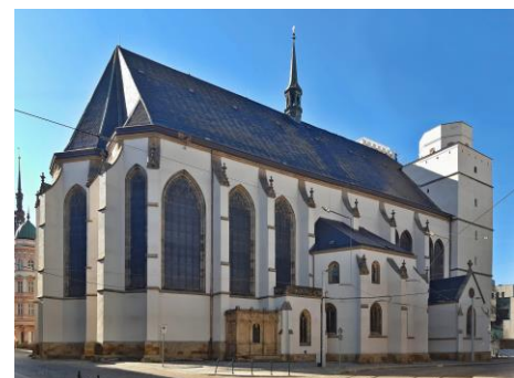
Saint Moritz Church

Building of the St. Moritz Church started in about 1412, but it was not finished until 1540. One of the reasons of the delay were cruel Hussite Wars which broke out in Bohemia and Moravia in 1419, several years after the Bohemian church reformer Jan Hus was burned at the stake in Constance (in Switzerland), and finished in 1434. All the lands of the Bohemian