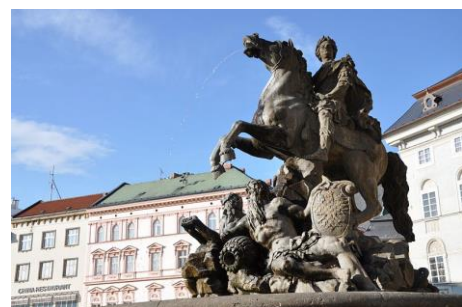
Baroque Caesar's Fountain

Speaking about architecturally significant buildings, it is definitely Baroque. The reason is that the city was almost razed to the ground during the Thirty Years's War (1618–1648), and so it had to be built completely anew just in the time when Baroque was the prevailing European style. The 17th and 18th century were also times of big religious zealotry and so it is no wonder that many religious monuments originated then,