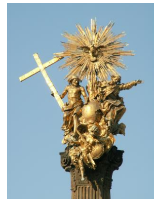
Top of the Holy Trinity Column

My favourite site is definitely the Holy Trinity Column, because its architecture is of world significance despite the fact that it was all made only by local architects and craftsmen. Nowadays there are much higher buildings in Olomouc, but I imagine that in the time of its completion it must have been a really splendid look at Olomouc from the distance with the column erecting above all its houses and palaces and with its gold-plated group of statues on the top, reflecting the sun rays far into the surroundings.