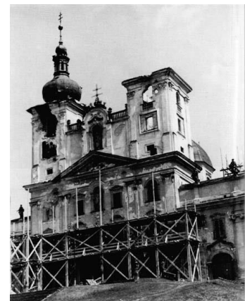
Church of the Visitation of Virgin Mary after Russian bombardment in 1945

The Holy Trinity Column survived all the historical events which have passed through Olomouc well and so its main enemy is the time itself along with all the natural elements like rain or frost. The largest renovation was done between 1999 and 2001, after it was found out that some of its sculptural decoration may collapse. Since that time it has been under detailed observation and its condition is stabilized.