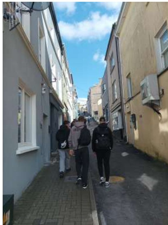
Streets of Cobh