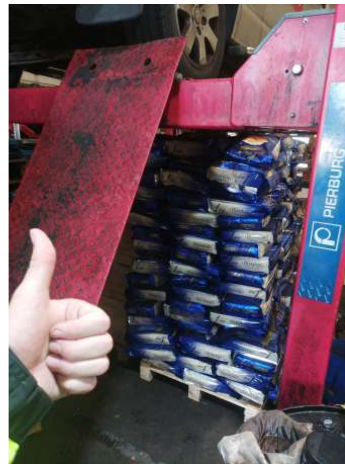
Support for Pakistan