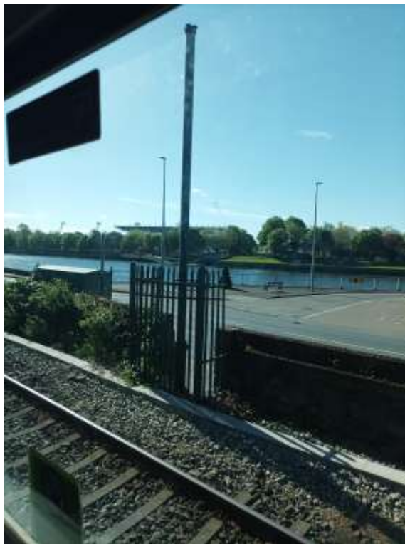
The train ride