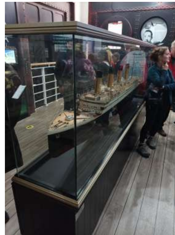
Museum of the Titanic